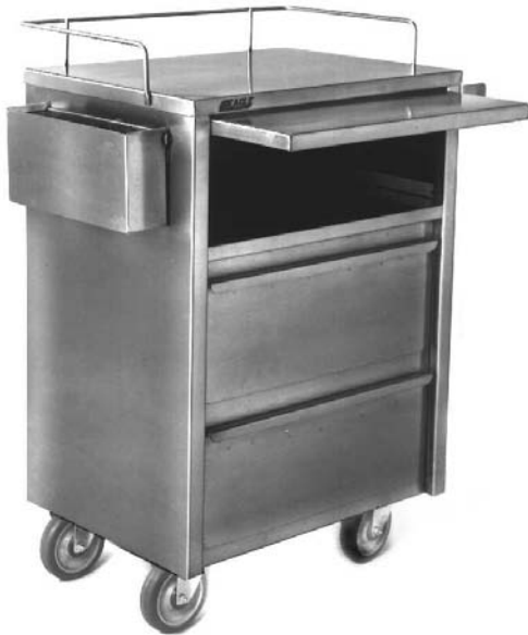
#CTC1724 clinic treatment cart

Constructed of 300 series stainless steel 17" wide by 24½" long. Overall height to the work surface of 35". Wire ledge on three sides of the work surface. Two pull-out drawers with positive stops, one open shelf, and one pull-out tray. 5"-diameter swivel plate casters—two with brakes.