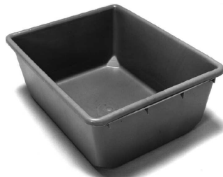
bulk supply tub