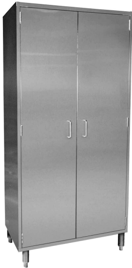
#SSC-TSC-1836 stationary unit

All stainless steel type 304 enclosed cabinet. Four adjustable shelves, 18" or 24"-deep by 36"- or 48"-long. Available with sloped top for laminar flow.