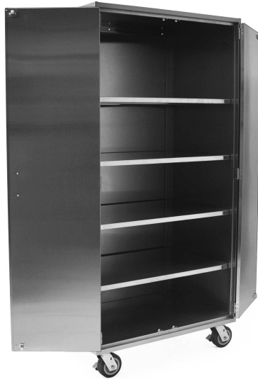
#SSC-TSC-2436-CPB mobile unit