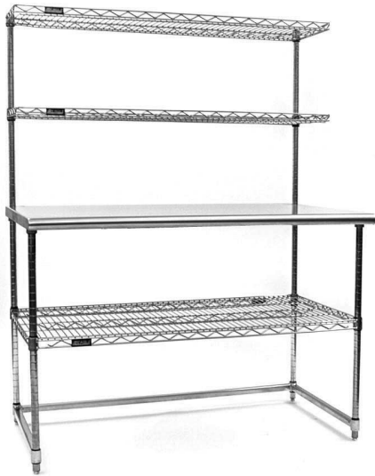
AdjuSTable® with Cantilevered Overhead System—shown with two C-frame bases

Eagle AdjuSTable® Work Surface System with Cantilevered Overhead System, model _____. Heavy gauge (brushed, electropolished) stainless steel top with choice of base combination: one wire undershelf and one C-frame or H-frame, or two C-frames or H-frames. Two 12"-wide (chrome, stainless steel) cantilevered overshelves. Two 33" front posts and two 63" rear posts. Wire undershelves feature patented QuadTruss® design (patent #5,390,803).