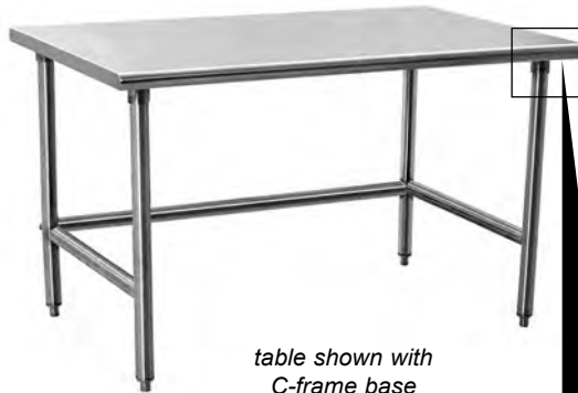
table shown with C-frame base

Solid 14 gauge type 304 worksurface with electropolished stainless steel finish. Available with 1½" C-frame or H-frame tubular base, or with undershelf base. Uni-lok® gusset system. Stainless bullet feet adjustable to 1".