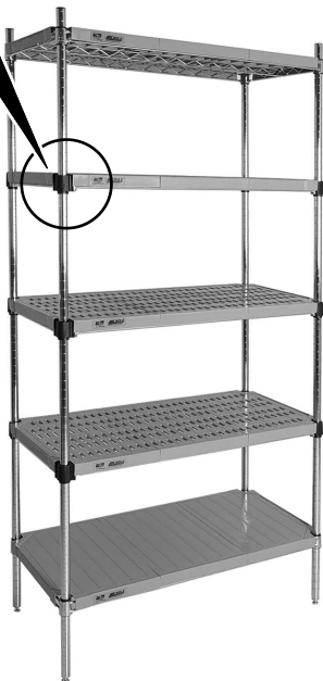
shelf unit with QuadPLUS®