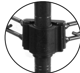
Quad-Adjust® Collar - allows the addition or removable of a shelf without having to disassemble the entire shelf unit.