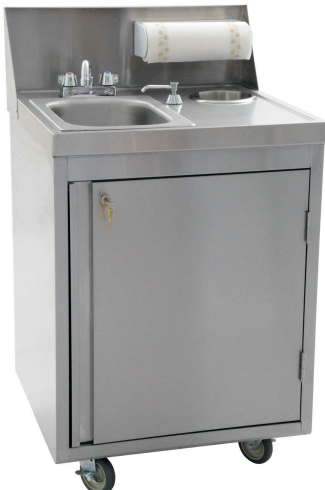
sink with single bowl

Features stainless steel cabinet body with double pan hinged stainless steel locking door. 4" casters (2 w/brake, 2 swivel) with non-marking tread. Overall dimensions: 24" width, 26" length, 44-1/2" height.