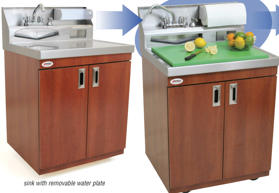
sink with removable water plate

Remove the plate by simply lifting the front of the plate and unhooking the rear flange.