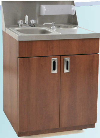
sink with single bowl

Features plywood cabinet base with "Biltmore Cherry" Wilsonart® laminated millwork, locking doors with satin finish handles, and 3" recessed plate casters with rubber tread. Overall dimensions: 25" width, 28" length, 44-1/2" height.