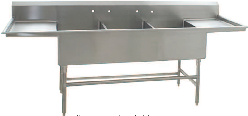
three-compartment sink shown