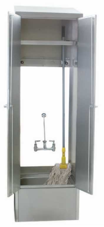
#F1916-VSCS (shown in use with service faucet)